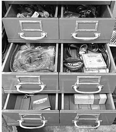
Parts cabinet looks fairly well-sorted, but there are stacks of things that would require an expert eye to identify.

There is supposed to be interior material for the Sedan, I think, more